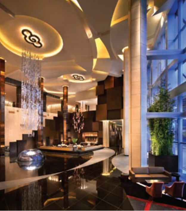
Grand Hyatt Macau Lobby

The Grand Hyatt Macau is located off the tip of Macau Peninsula in the Cotai area. This exclusive hotel is part of the City of Dreams urban resort center and features 791 rooms and suites with spectacular views. The two distinct towers offer spacious comfort, whether for business or leisure travelers. All the stylish guest rooms are equipped with Safeplace Magna 800 safes.