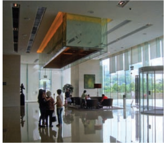
Hong Kong Hyatt Regency Tsim Sha Tsui Lobby

Hong Kong's Hyatt Regency Tsim Sha Tsui is situated in the heart of the business district in one of the tallest skyscrapers in Kowloon. The 381 rooms and suites offer spectacular views of Victoria Harbour and Hong Kong Island. Like its sister hotel, the Hyatt Regency Shatin which installed Safeplace the previous year, the Hyatt Regency Tsim Sha Tsui chose deluxe Safeplace Magna 800 safes for all its guestrooms. ■