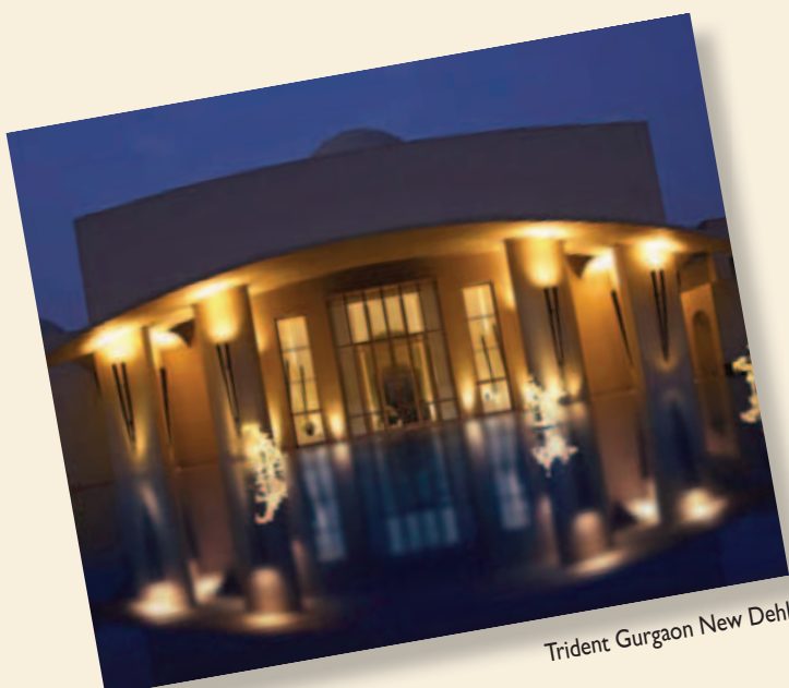
Trident Gurgaon New Delhi

Trident Gurgaon New Delhi: Voted "India's Leading Hotel" and "Asia's Leading Meetings Hotel" at the World Travel Awards in 2007, the Trident Gurgaon is located among seven acres of landscaped gardens and pools in the central business district of Gurgaon in New Delhi. All the sumptuously equipped rooms offer the Magna 800 digital safe. ■