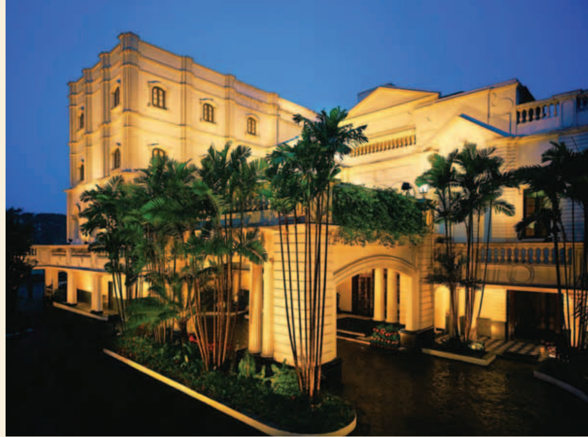
Oberoi Grand Kolkata

O beroi Hotels and Resorts, the most prestigious hotel chain in India, has been consistently voted the best hotel chain outside the U.S. in magazine reader surveys. Founded in 1934, the Oberoi Group includes both Oberoi Hotels and Resorts and Trident Hotels, all elite five star properties. Safeplace is proud to announce that we have been granted preferred supplier status for the Oberoi and Trident hotels.